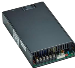
F type: 8(L)X5(W) X 2 (H) inches E type: 9(L)X5(W) X1.6(H) inches